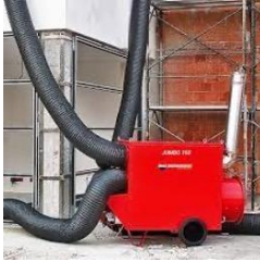
Example of indirect heating system.