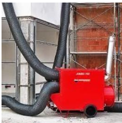
Example of indirect heating system.